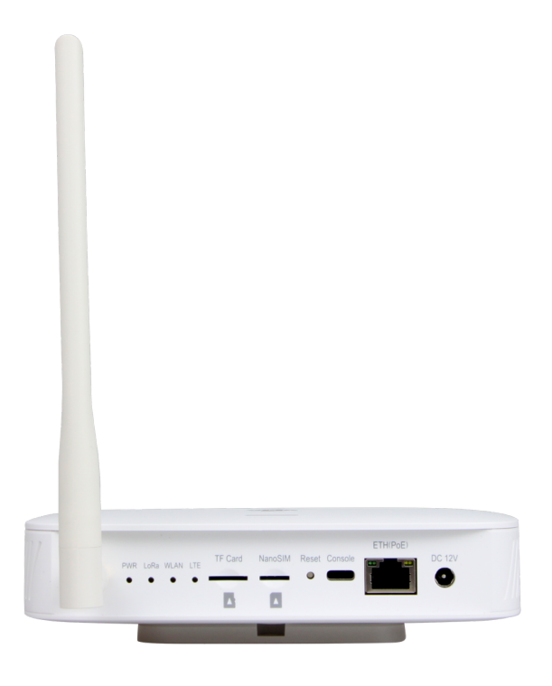
Figure 2: WisGate Edge Lite 2 Interfaces